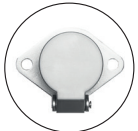
CH2F 20A charge / discharge socket supplied