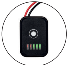
Fuel gauge supplied